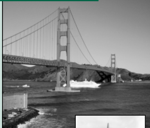
Golden Gate Bridge.

Complimentary hors d'oeuvres and beverages will be served.